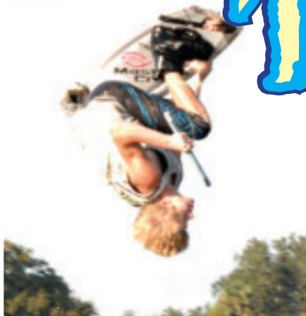
As you rotate the back flip after grabbing the board, look back to spot your landing.