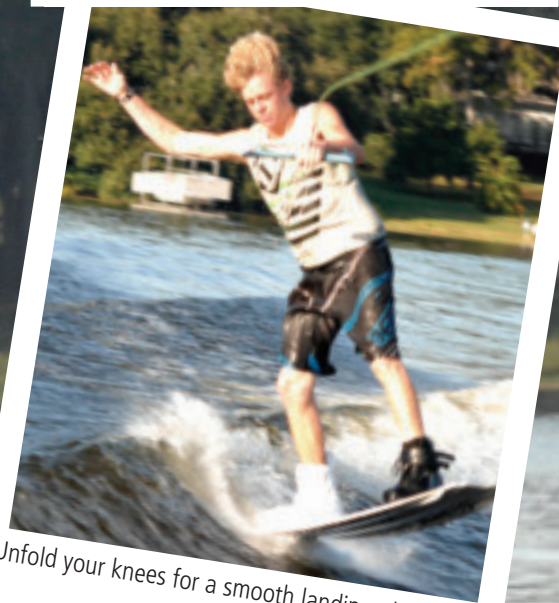
Unfold your knees for a smooth landing, then...

★ A MOBY DICK IS A TANTRUM WITH A BACKSIDE 360 THAT IS HANDLE PASSED.