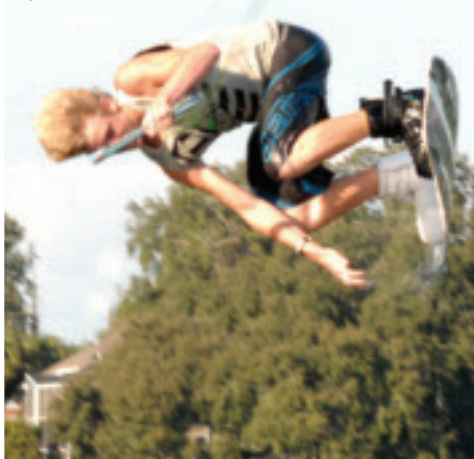
When you spot your landing, begin to let go of the grab and start to unfold and prepare for the landing.