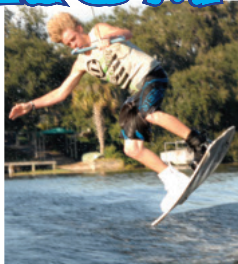
This is when you would pull it to blind (180-degree turn) if you were doing an Indy Tantrum to Blind.

★ A TANTRUM TO BLIND IS A TANTRUM WITH A BACKSIDE 180 AT THE END.